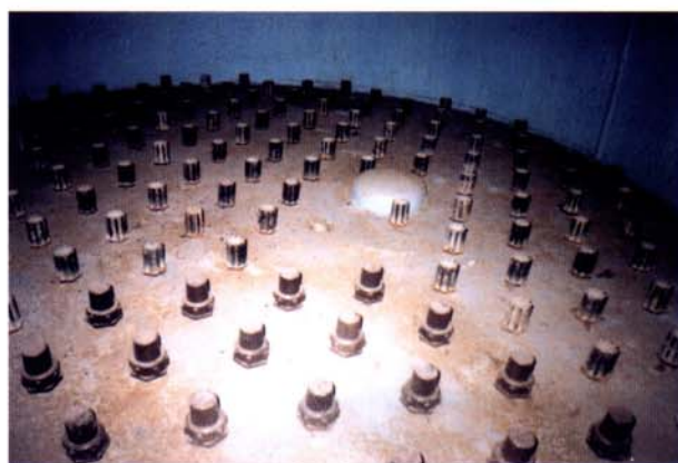
Fitting of sand filter PFZ