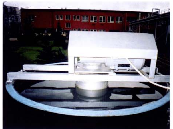
Continuously operating sand filter VIVASAND

During the filtration process, the polluted water brought to the bed of sand by means of the central pipe and the distribution arms, flows through the bed of sand to the upper part of the filter and from there through the overflow to the filtered water outlet.