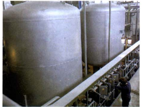
Closed pressure sand filter

consists of a pressure tank, in which there is a fitting enabling the filter function. The fitting consists of the inter-bottom with nozzles, upper and lower distribution systems and the pressure air distribution. The filter works in three modes: filtration, back-washing and raising. During filtration water goes through the filtration layer and the inter-bottom with the nozzles. When the filtration filling is clogged, the filter back-washing is carried out. By means of backwash water and air the filling is cleaned by the opposite flow than the filtration one. Material is carbon or stainless steel and plastic. The pressure filters can also be delivered in the multi-layer version.