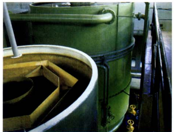
Open atmospheric sand filter

operates on the same principle as the pressure filter apart from the fact, that the filter casing is an open tank and water goes through the filling by means of the gravity. This saves energy with the necessity to enlarge the filtration area. Material is again the combination of the carbon steel or stainless steel and plastic.