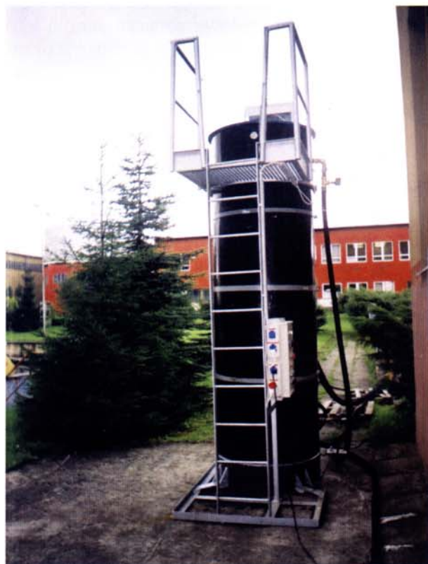
Continuously operating sand filter in paper mill, CR

During the waste water treatment, sand filters are used as the last stage of the tertiary treatment, especially in the area where the purified water is used for irrigation or as service water. The contribution of the continuously operating sand filters VIVASAND is clear undoubtedly also in this area.